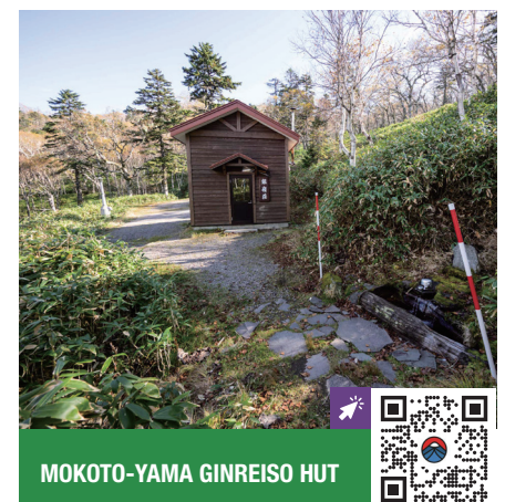
MOKOTO-YAMA GINREISO HUT