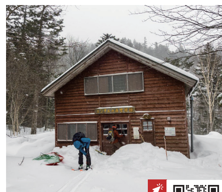
NINGLE FOREST MANAGEMENT HUT

From the winter trailhead, the closest onsen is Furano La Terre (ふらのラテール, 980yen). It's about 14km (20mins) from the trailhead. There's indoor baths, a cave bath, outdoor baths - it's a huge facility. It also has an attached restaurant. If you're headed further into central Hokkaido, then it would be worth making the extra 20 minutes drive up the mountain to the Tokachi Onsen area. Ryounkaku (凌雲閣, 800yen) at the end of the road arguably has one of the most epic outdoor onsen views in Hokkaido. Of course there's good old Hakuginso (白銀荘, 700yen for a soak). And for the adventurous, there's the Fukiage Onsen free wild onsen just down the road from Hakuginso (吹上温泉, free). ■